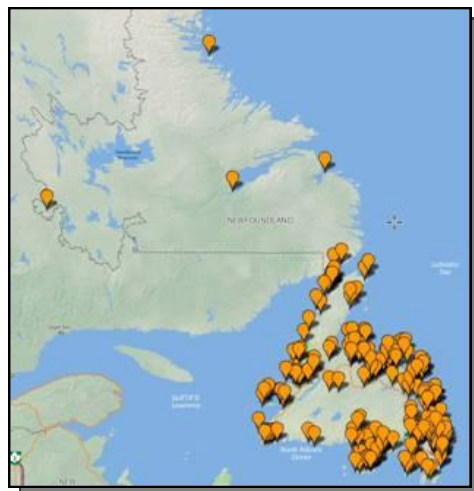
designates communities with SWASP placements

The tuition voucher is recognized as an excellent means of saving money for post-secondary studies, thus reducing student loans and easing the financial burden on families.